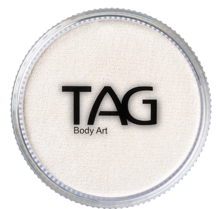
Pearl White - for highlights