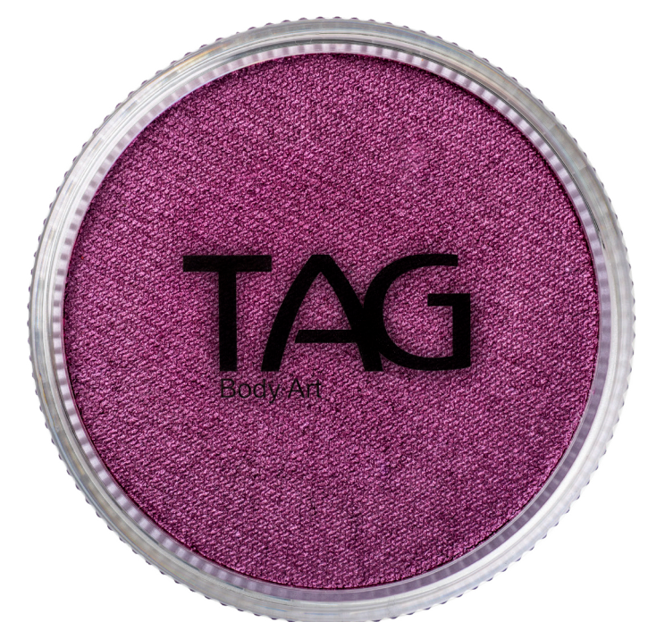
Pearl Wine - for lips