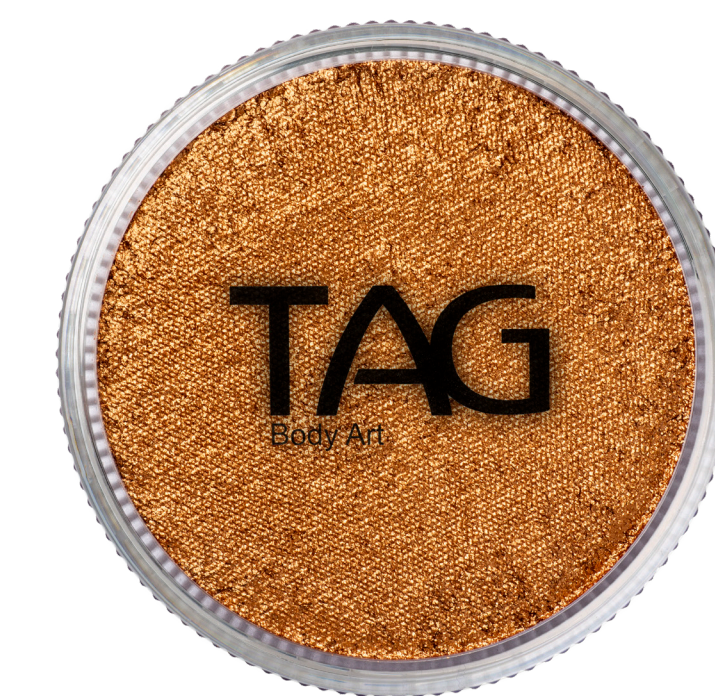
Pearl Old Gold - for eyelids