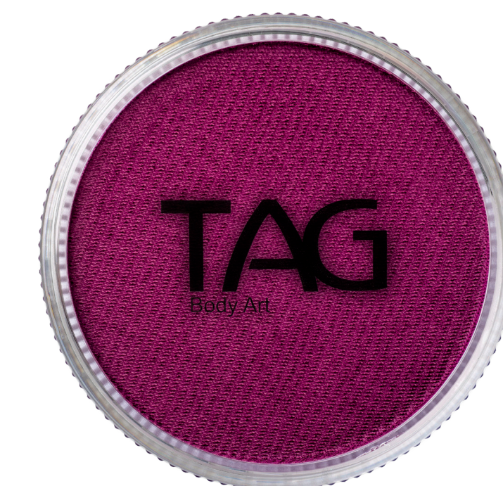
Berry Wine - for flower petals & dots