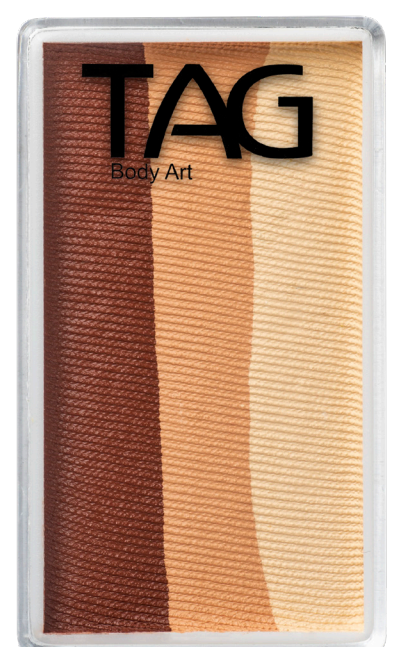
Teddy Bear- for leaves