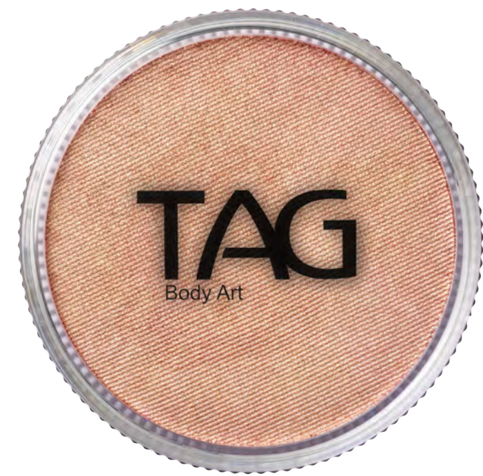
Pearl Blush - Forehead & eyelids