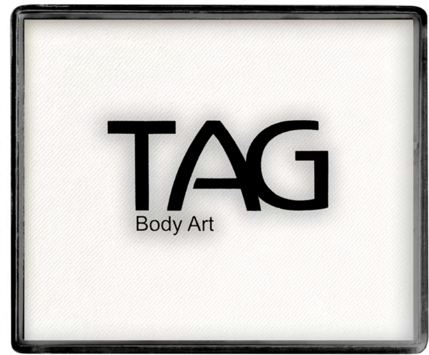
Regular Strong White - Dots & outlining