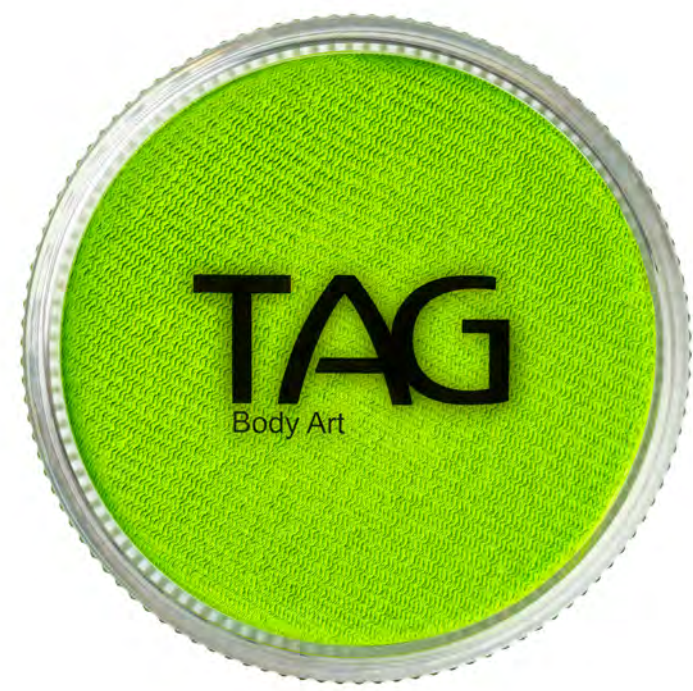
Light Green - Leaves